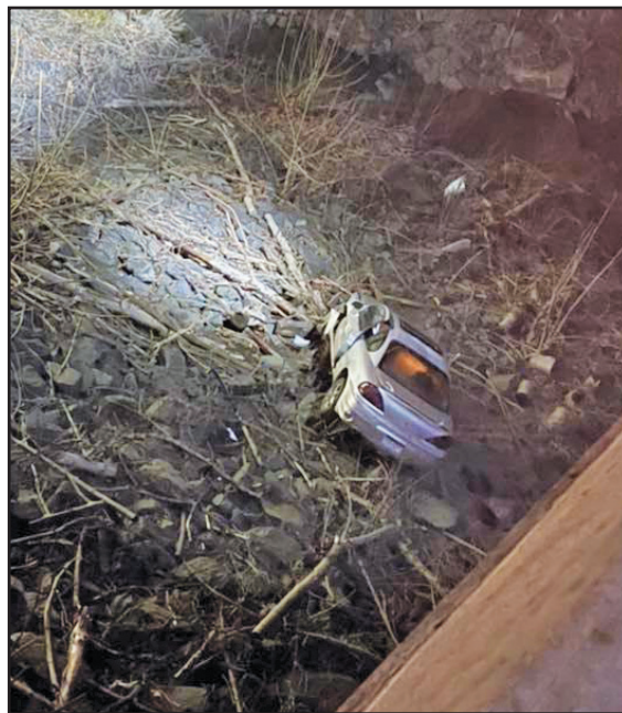
The Concord and Rustburg Volunteer Fire Departments responded to a vehicular accident at 1:45 a.m. Friday and rescued a trapped Appomattox woman.

Subscribe to the Times Virginian online, in person or over the phone: 434-352-8215.