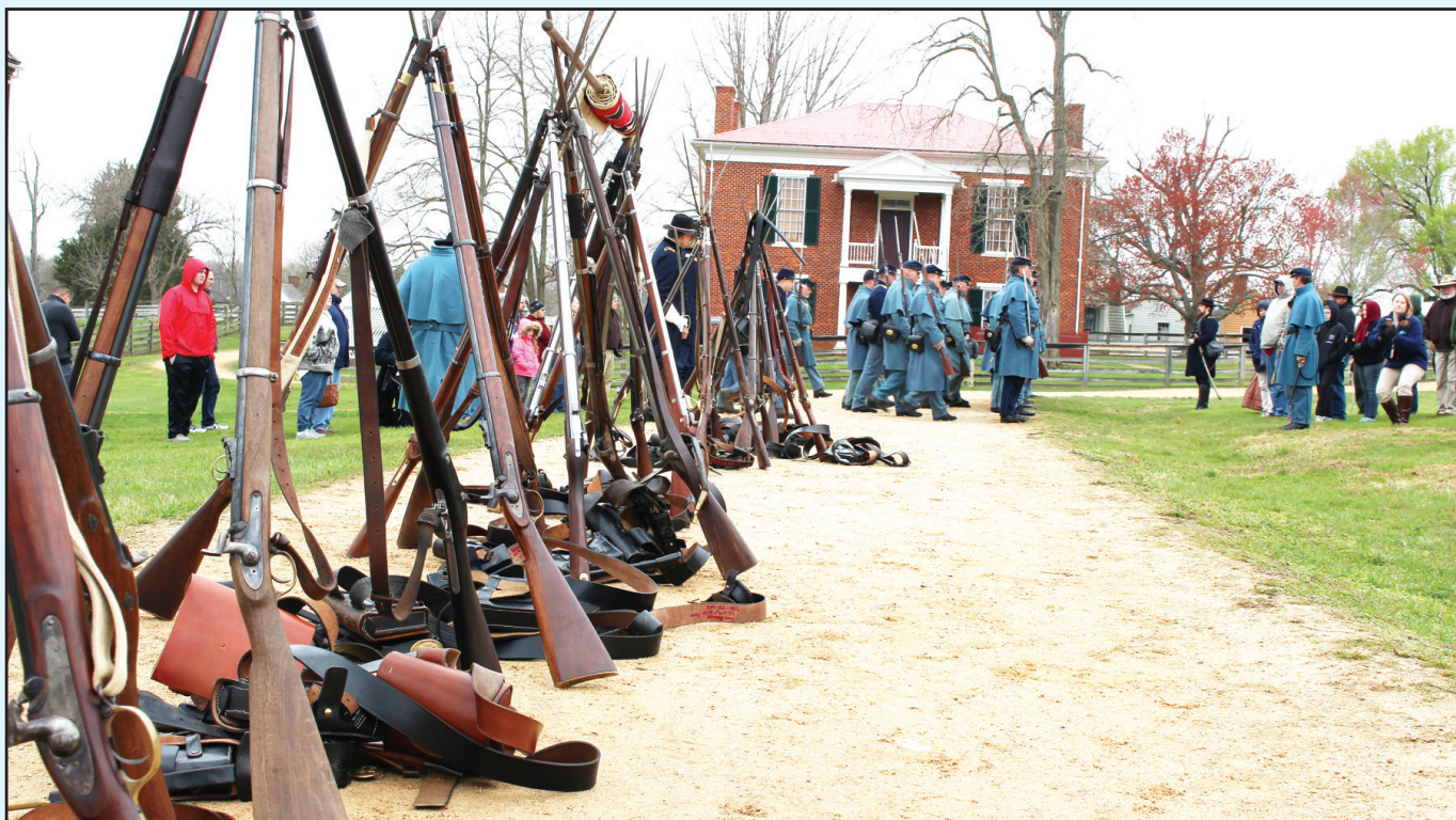
Shown is a scene from the 2018 153rd Anniversary of the Surrender at Appomattox Court House National Historical Park.